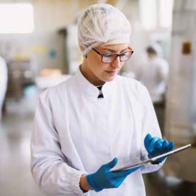
Dust extraction systems