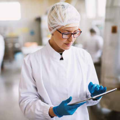
Dust extraction systems