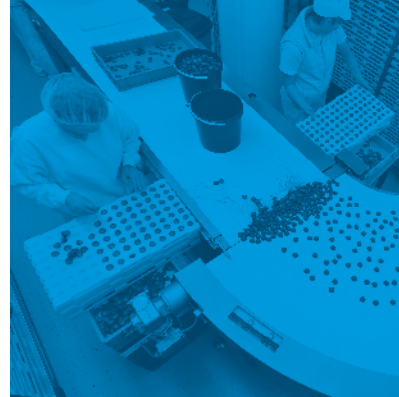
Centralised vacuum & conveying systems